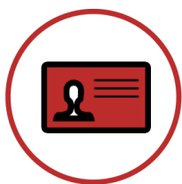
Change in Citizenship