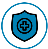
Loss of Essential Coverage

If you do not submit the online change form to notify Employee Benefits within 31 days of a qualifying event, you will have to wait until the next Annual Open Enrollment period to make benefit changes unless you have another qualifying event.