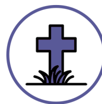
Death in Family