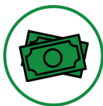
Change in Income