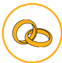
Marriage or Divorce