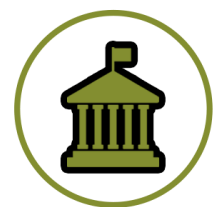
Change in Gov. Assistance Eligibility