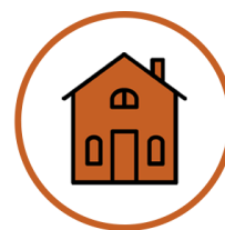
Gain in Coverage