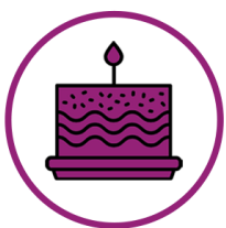
Aged off of Parent's Plan