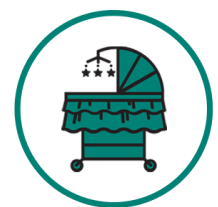
Birth, adoption, or new dependent