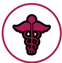
Loss of COBRA Benefits