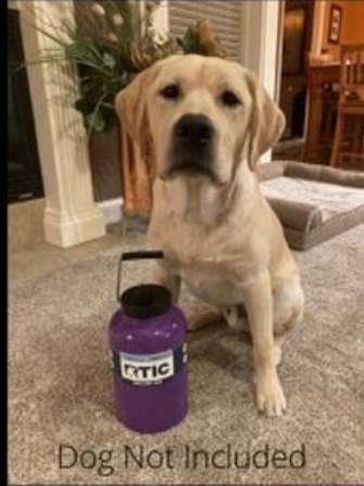
Dog Not Included

64 OZ GROWLER AND A GIFT CARD TO BROADWAY BREWERY & RESTAURANT